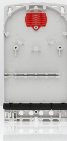
10418994 SDU-Wallbox-SP-S-empty Interior