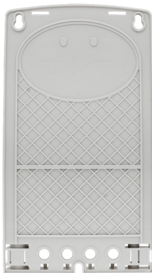
SDU-Wallbox-SP-S-empty Rear side