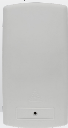
10418994 SDU-Wallbox-SP-S-empty Front side

FTTH demarcation point for up to 4 adapters / 12 splices