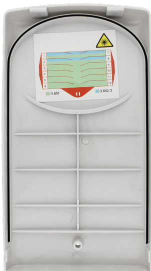
SDU-Wallbox-SP-S-empty Cover inside